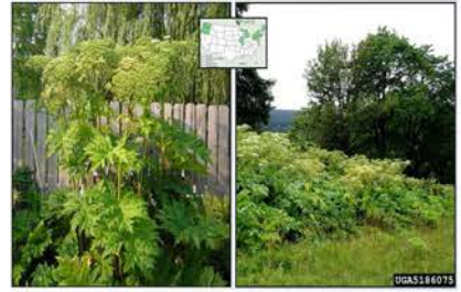
Description: Biennial grows up to 15' in height.

Stems: Are greenish with purple splotches, 2"-4" in diameter with coarse hairs, hollow.