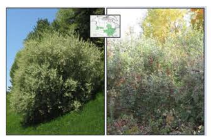
Description: Weedy deciduous shrub measures 20' by 20'. Bark: Sivery grey with smooth